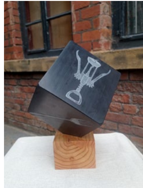
Canteen 15 x 15 x 15 cm Relief carved Welsh slate cube £600