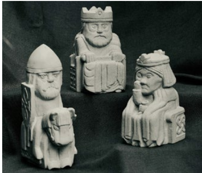
The Chessmen of Lewis – King, Queen and Knight 27 x 16 x 12 cm Ancaster Stone Set of 3 pieces