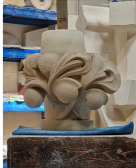
Stiff Lead Capital Study 20.5 x 20 x 20 cm

Liam is currently undergoing study with the Cathedral Workshop Fellowship and the pieces being exhibited have been completed at work as part of this.