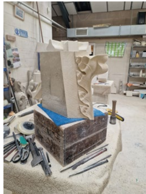
Gloucester Crockett Study 30 x 15.2 x 24.5 cm