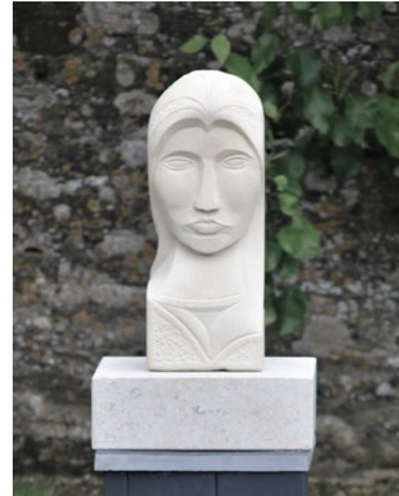
Severine 51 x 30 x 21 cm French Caen limestone on a Bath limestone base