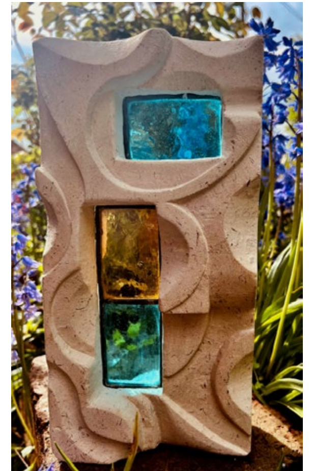
Stained glass and abstract stone 30 x 18 x 7 cm Ancaster stone, vintage stained glass