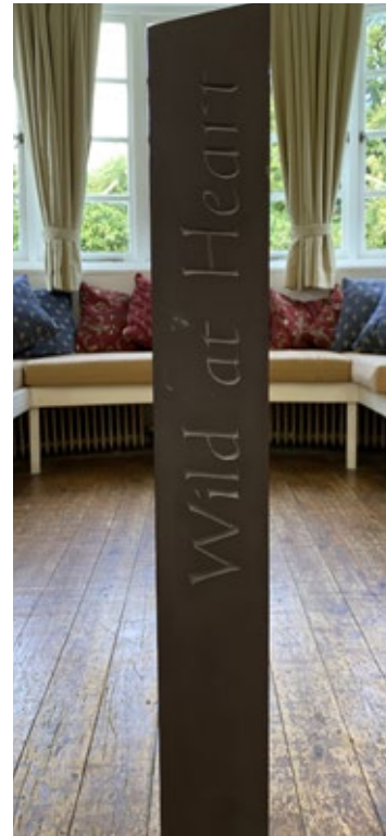
Wild at Heart Purple plum slate, 23 carat gold leaf 870 x 85 x 43 cm