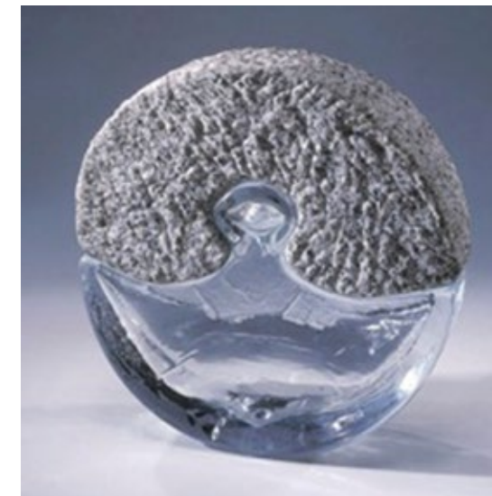
Water and Rock 59 x 18 x 24 cm Stone Bronze Glass Steel