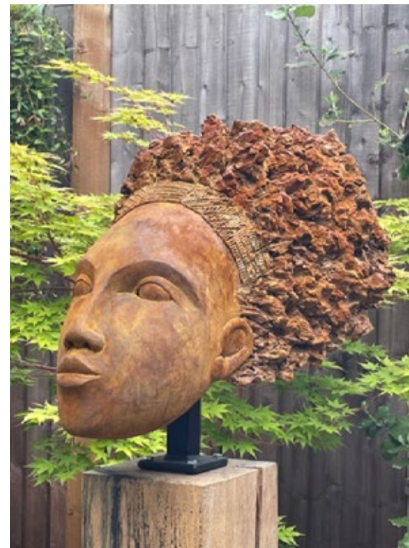
Deity 75 x 60 x 35 cm Iron resin