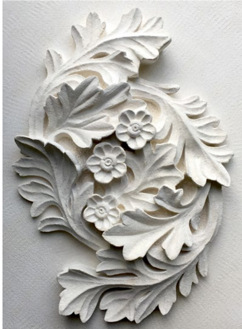
Wild Celery 44 x 35.5 x 10 cm Limestone

The piece in this exhibition is an original composition based on celery leaves, inspired by one of the corbels in Exeter Cathedral.