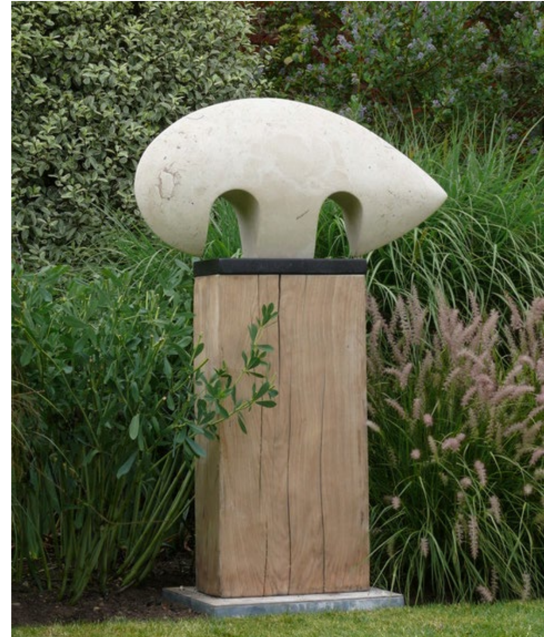
One way or Another 70 x 25 x 23 cm Portland limestone, Oak Plinth