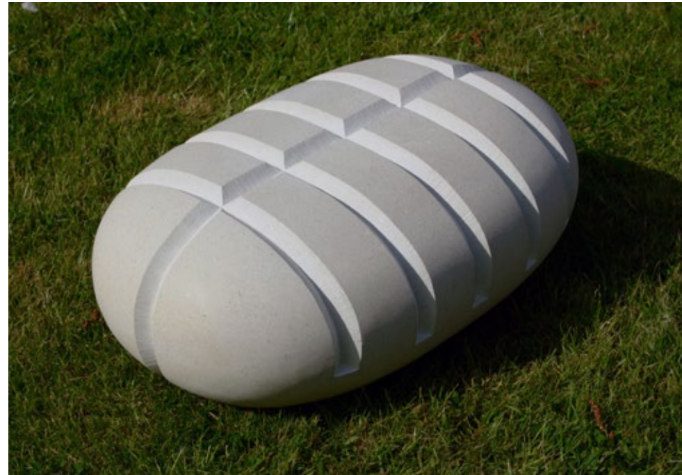
Untitled (incised ovoid form) Portland Stone 15 x 41 x 26.5 cm