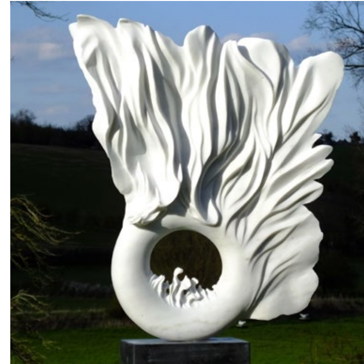
Cerchio di Fiamme I 78x 67 x 17 cm Statuary Carrara marble