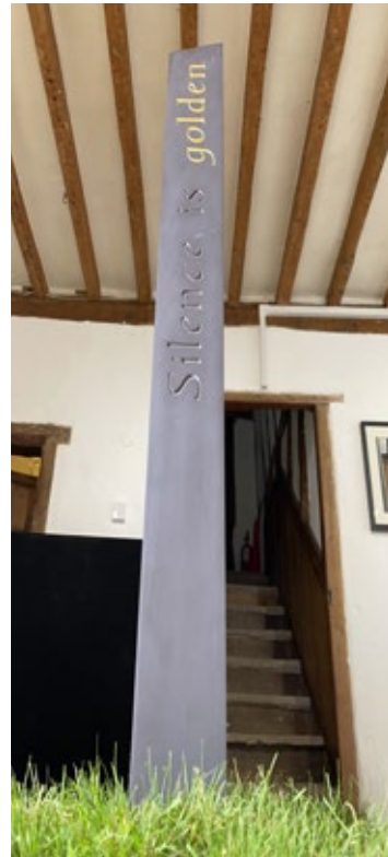
Silence is Golden Purple Plum slate, 23 carat gold leaf 870 x 85 x 43 cm

He thrives on the end result and meeting the criteria set by the customer often resulting in raising the expectations with the image on paper becoming an actual portrayal of work carved into any piece of stone. He feels that a memory needs to last a lifetime and since his work often arises from personal recommendations, he continues to aim for nothing but perfection.