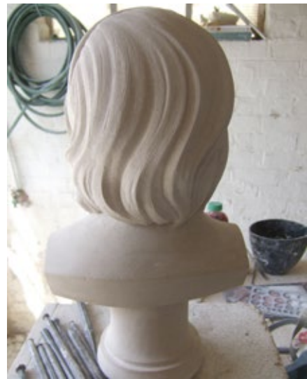
Toshiko with Manga Eyes Portland Limestone 40 x 25 x 25 cm