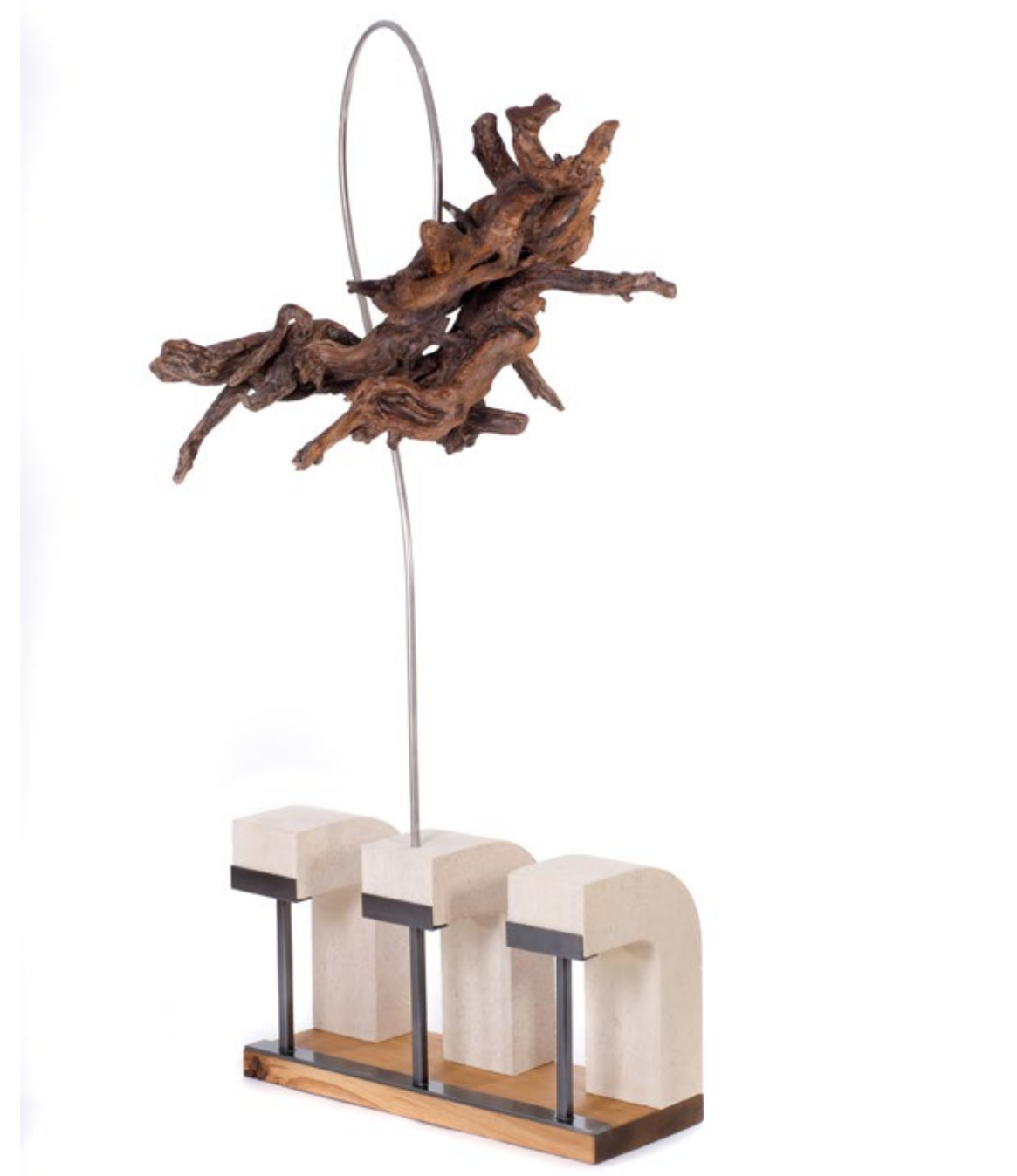
Oxen Yoke, Catran France Clipsham (Rutland) limestone. 190cm x 25cm