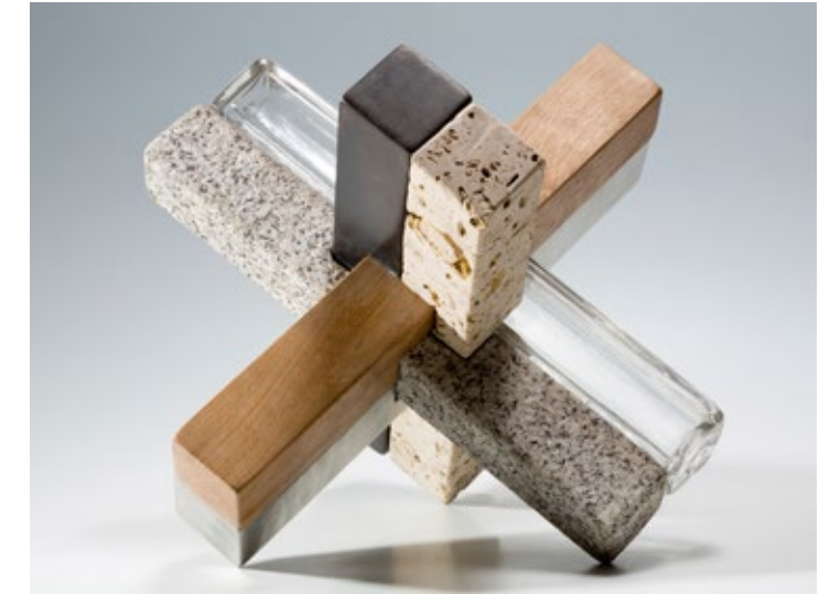
Six 59 x 18 x 24 cm Stone Bronze Glass Steel