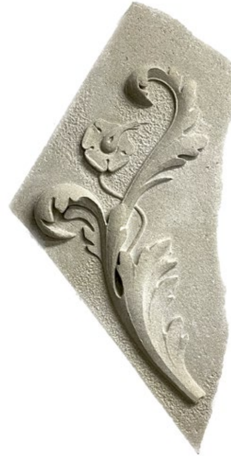
Scrolling Acanthus 50 x 30 x 3 cm Portland Stone