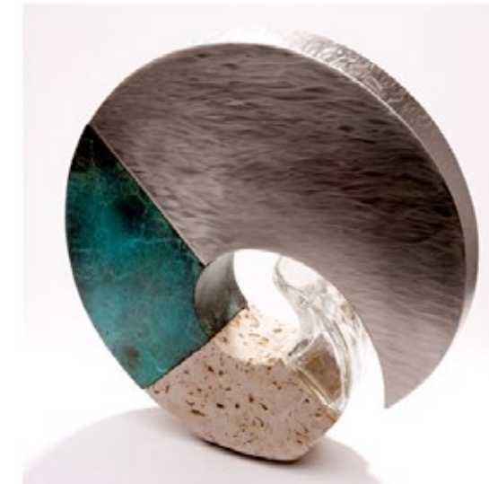
Nautilus II 59 x 18 x 24 cm Stone Bronze Glass Steel