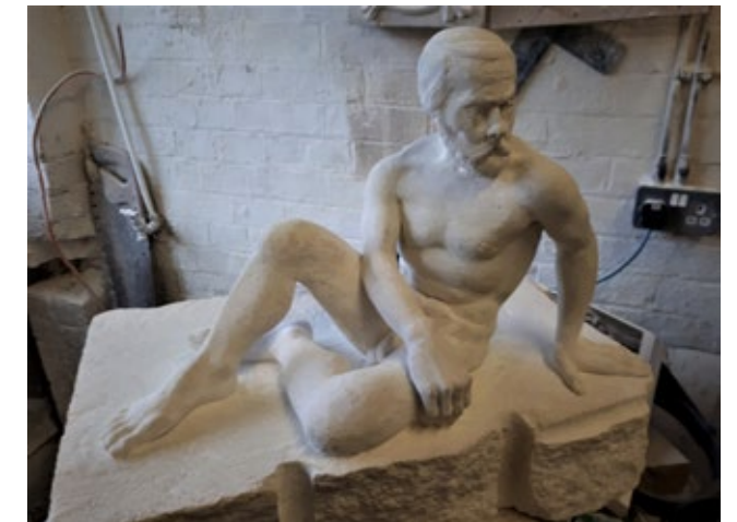
Male Nude Portland Limestone 30 x 40 x 26 cm