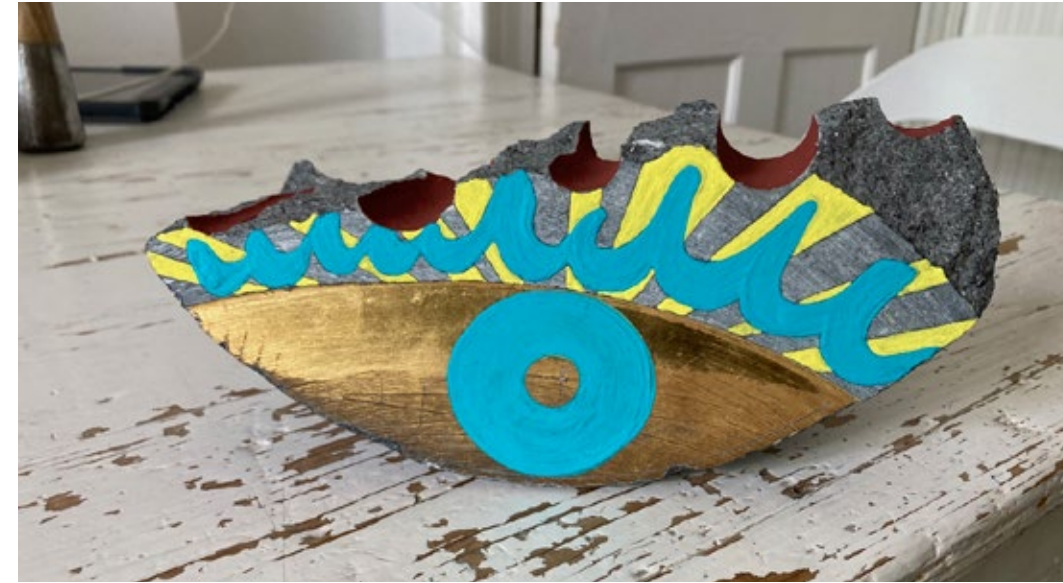
Eye 10 x 20 x 6 cm Kilkenny limestone with 24 carat gold leaf and mineral paint