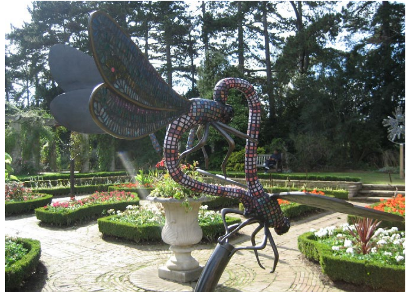
Go-for-It Nickel plated Bronze and glass mosaic Edition of 3 160 x 100 x 90 cm