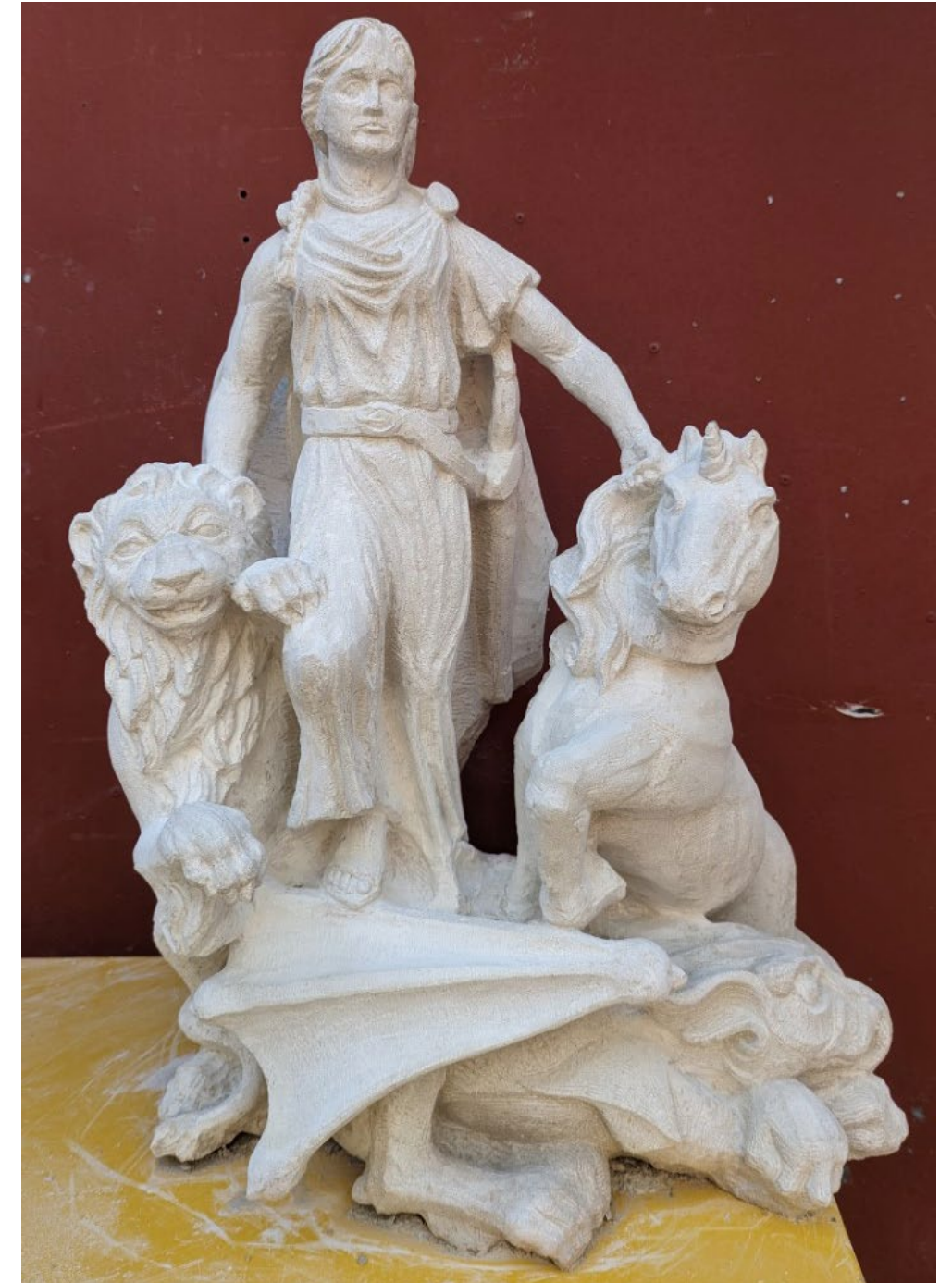
Britannia 85 x 50 x 53 cm Portland limestone