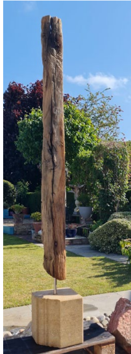
Oak Beam, Minervois France Clipsham (Rutland) limestone. 170cm x 23 cm.

Throughout his work he is conscious that the relationship between ancient materials and modern craftsmanship produces something timeless. He wants to honour carefully selected materials and it is important to him that every piece is meticulously finished by hand, using mallets and chisels. He is passionate about sourcing the materials himself. This ensures he is aware of its origins, whether from a particular field or woodland. Understanding where materials come from is instrumental in realising what they can become. Wherever possible, he works to use reclaimed stone as he believes it is important to respect the environment and produce sustainable work that breathes new life into what has been lost or discarded.