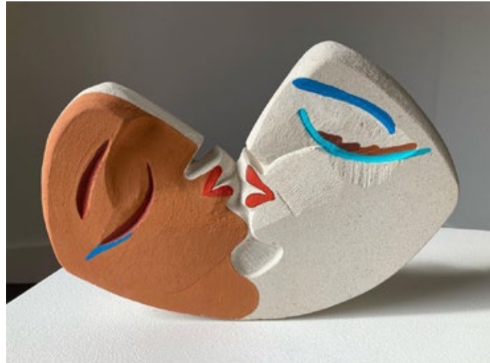
Argument 20 x 30 x 6 cm Two sided rocking sculpture- with kissing/arguing couple. Lighthearted piece illustrating an argument. Portland limestone and mineral paint