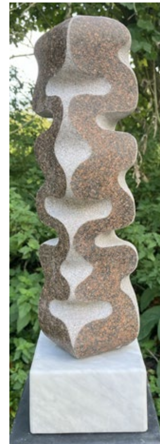
Stacked 53 x 15 x 15 cm Orissa Granite on Marble base

Mark Stonestreet's sculptures are a playful investigation into line, definition and geometry. Working with negative space, light and shadow, Mark gives each of his sculptures direction and flow. Lines direct the form, textures are contrasted and complemented, and shapes are contorted into new, enticing arrangements. Yet each design maintains a sense of Mark's own, free hand carving, allowing his works to develop in an open and instinctive manner.