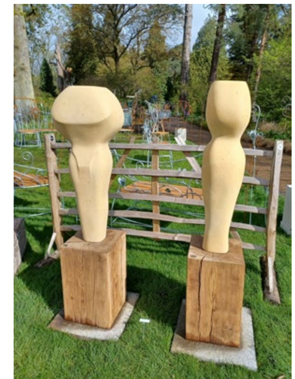
Together We Stand Maltese limestone on granite top plate and oak plinth 150 x 30 x 30 cm