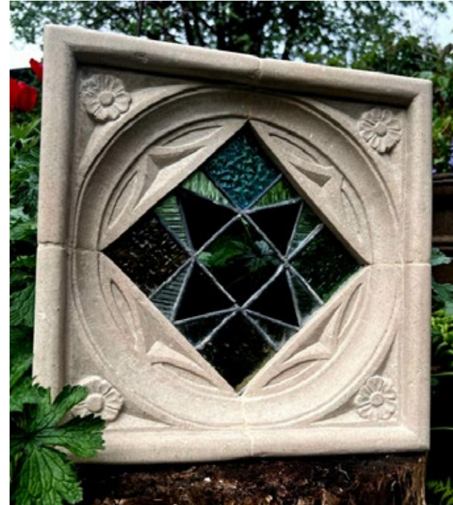
Tracery Window 33 x 33 x 9 cm Portland stone, antique stained glass panel