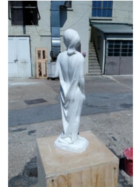
Female Study Pentalic Marble 60 x 18 x 18cm