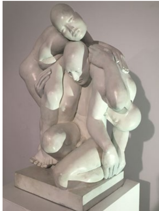
Embrace 60 x 35 x 35 cm Patinated Bronze ed 1/9

Her figurative pieces show a sensitivity and understanding of human forms and emotions.