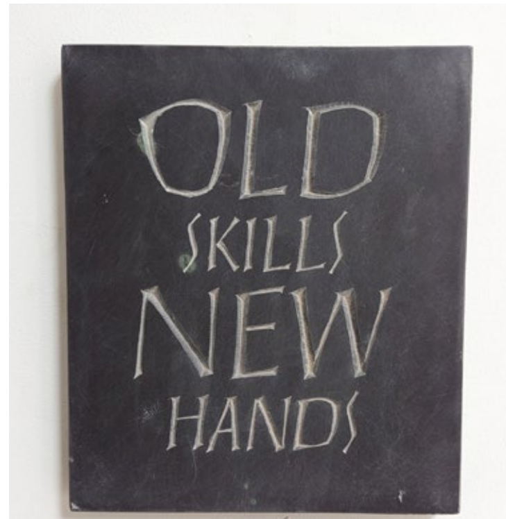
Old Skills, New Hands 28 x 20 x 2 cm