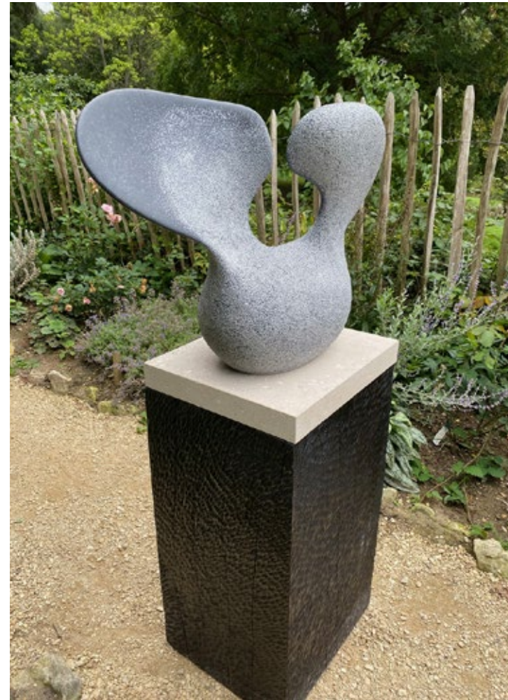
Baetylus 60cm x 45cm x 23cm, Kilkenny Limestone, Oak plinth

The intention is to recall some past primeval state while playing with the ambiguity and form of the artefact. The work invites the viewer to multiple readings, where the mystery is in their elusiveness.