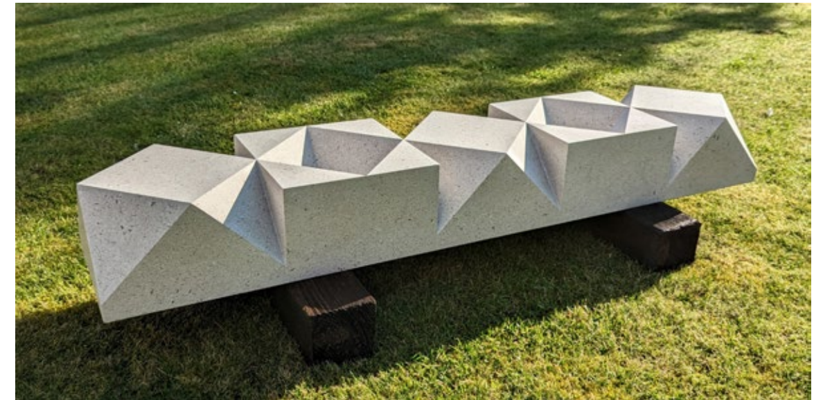
Five Nabresina limestone 20 x 125 x 25 cm