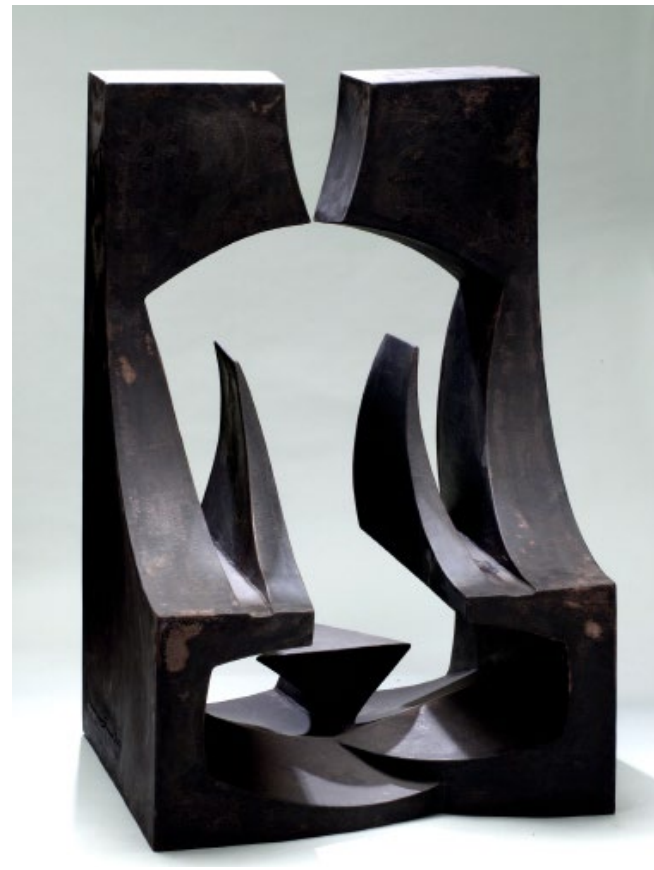
Contemplation 54 x 34 x 27 cm Bronze

He is known for the complex combinations of materials, shapes and textures. The intertwining and interlocking elements of stone, bronze, steel, glass and wood fuse the strong with the fragile, the solid with the liquid, the smooth with the rough. The interplay between the elements is captivating.