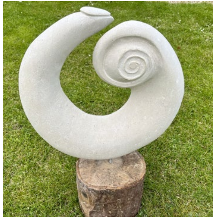
Open Enso 40 x 39 x 8 cm Portland Stone, includes a pine tree-stump plinth, into which the sculpture is set via a steel pin