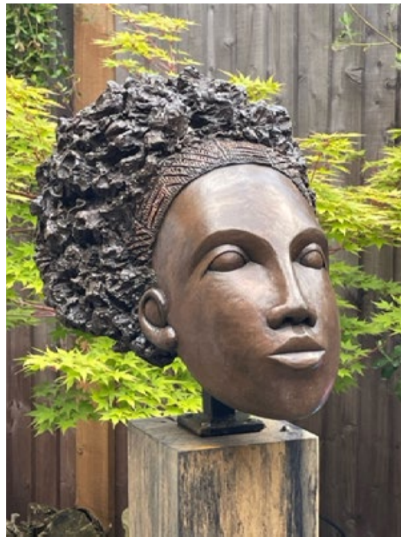
Deity 75 x 60 x 35 cm Bronze resin

The main inspiration for Chapman's sculptures comes from the art of ancient civilisations. The bronze figures with their strong idiosyncratic style appear at once powerful yet serene, with an essence of the spiritual energy of deities from primitive mythologies that watch like guardians over us all.