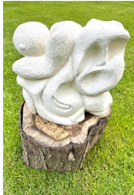
Resting 30 x 30 x 15 cm Bath Stone, includes a pine tree-stump on which the form sits.