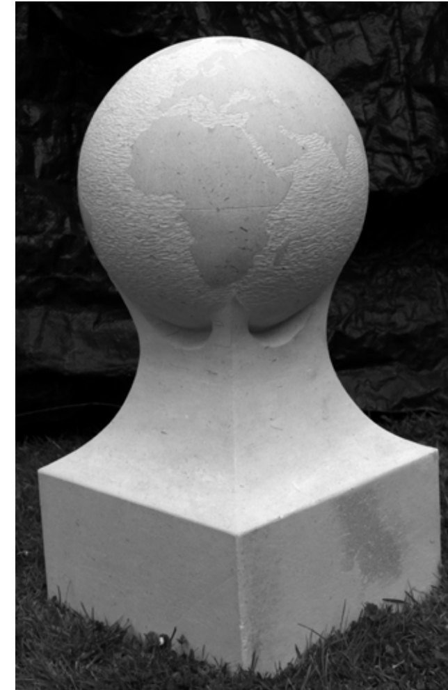
Atlas 53 x 25 x 25 cm Portland limestone