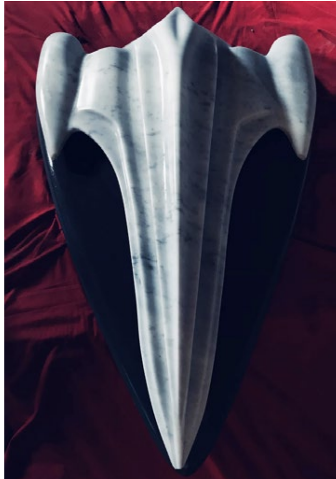
X-70B Based on the X-70B Phantom class starship from the Star Wars game.